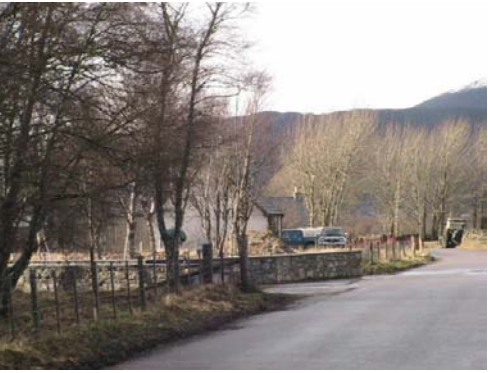
Fig.3 : Site (left) and existing dwellings

3. Although this is an application for outline planning permission, an indicative site layout plan has been submitted in support of the proposal. The site layout includes the footprint of a modest scale dwelling, proposed to be located in a relatively central position