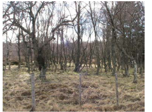
Fig. 2 : View into site